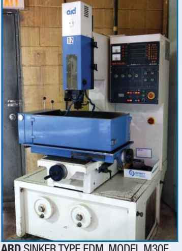
ARD SINKER TYPE EDM, MODEL M30E