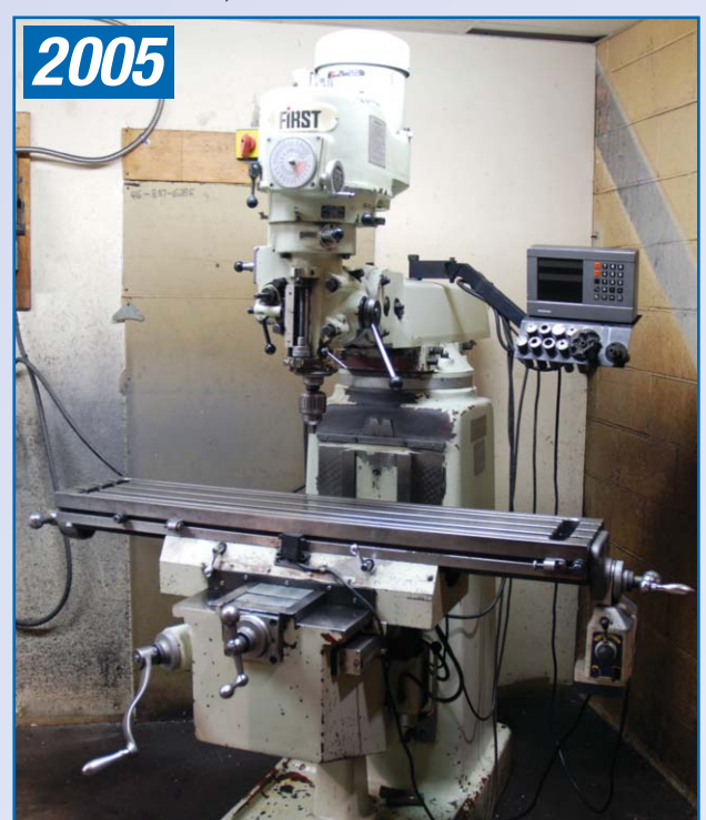
FIRST MILL MODEL LC 185 VS