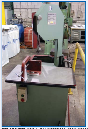
ER MAIER ROLL IN VERTICAL BANDSAW

This brochure is meant merely as a guide. Infinity Asset Solutions makes no guarantee, expressed or implied, as to the accuracy of the information in this brochure. Buyers should inspect the goods beforehand to satisfy themselves.