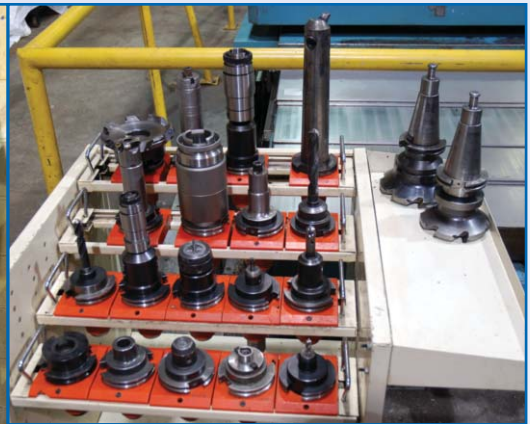
PARTIAL VIEW OF 40 & 50 TAPER TOOLING, TAPPING HEADS

1994 ARD Sinker Type, Model M30E, 3 Axis DRO Ard Pulse P30, sn 30566