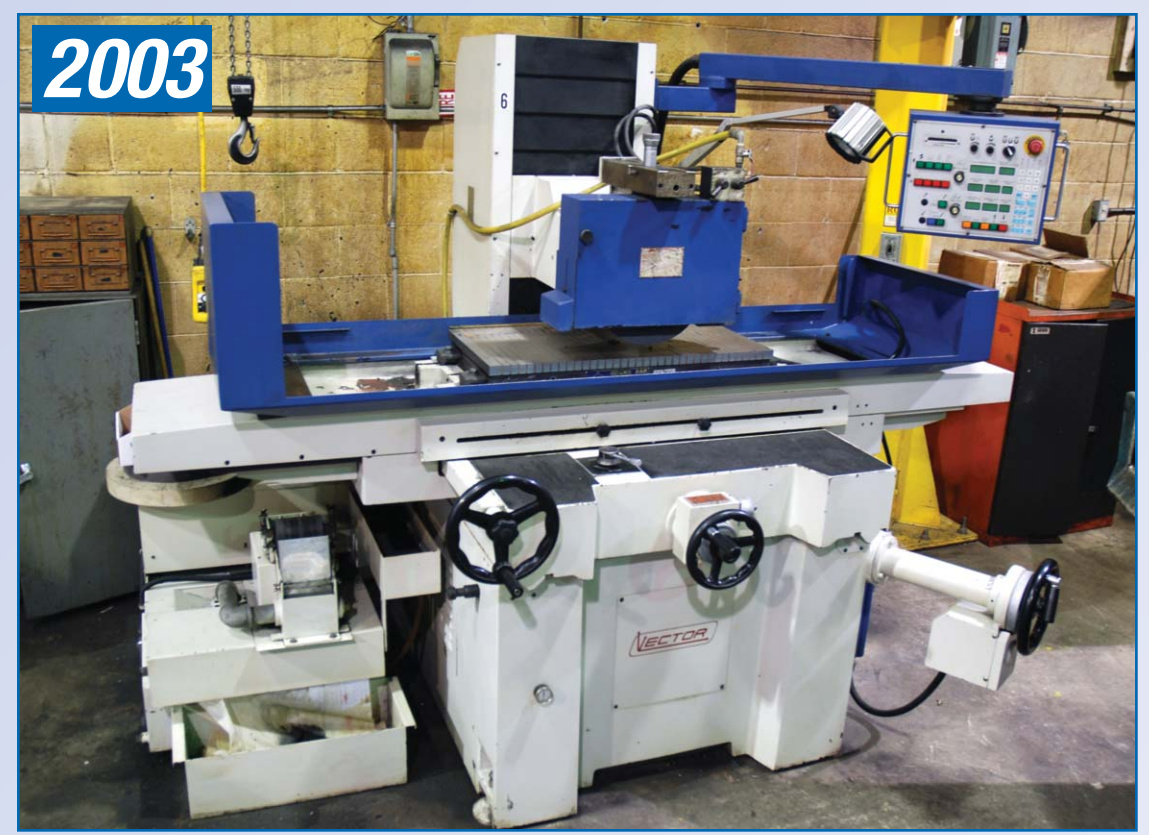
VECTOR 16"X32" FULL AUTO HYDRAULIC SURFACE GRINDER