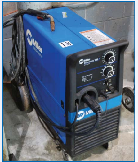
MILLER MILLERMATIC 250