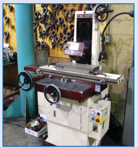
CHEVALIER 6" X 18" SURFACE GRINDER