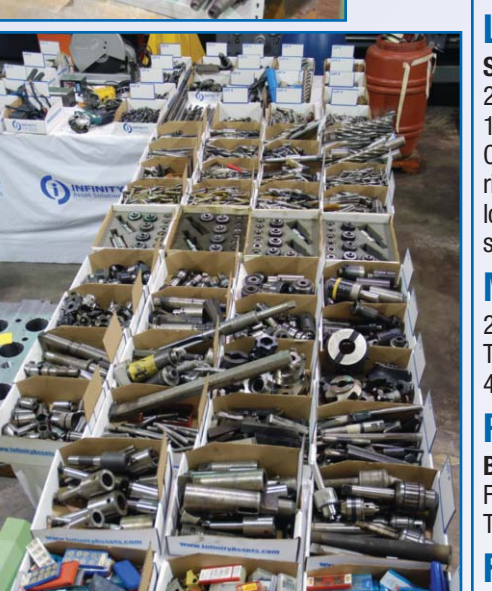
PARTIAL VIEW TABLE ITEMS