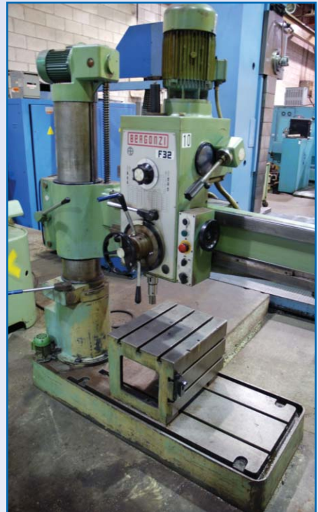
BERGONZI 3' RADIAL ARM DRILL, MODEL F32