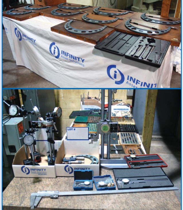
PARTIAL VIEW OF PRECISION INSPECTION