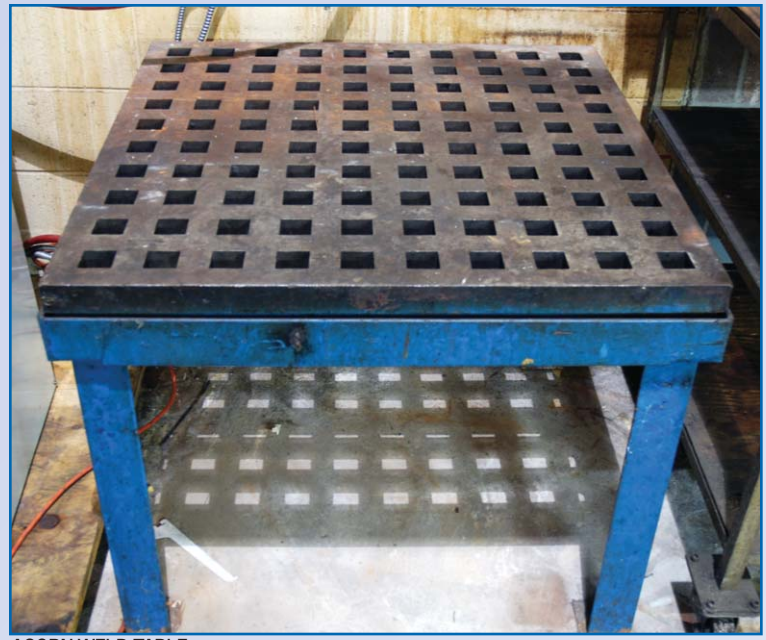
ACORN WELD TABLE