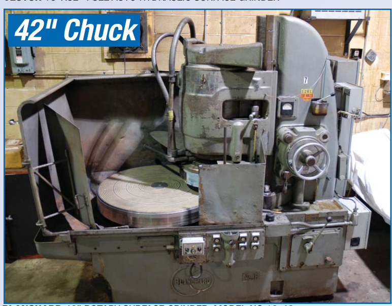
BLANCHARD 42" ROTARY SURFACE GRINDER, MODEL NO 18-42