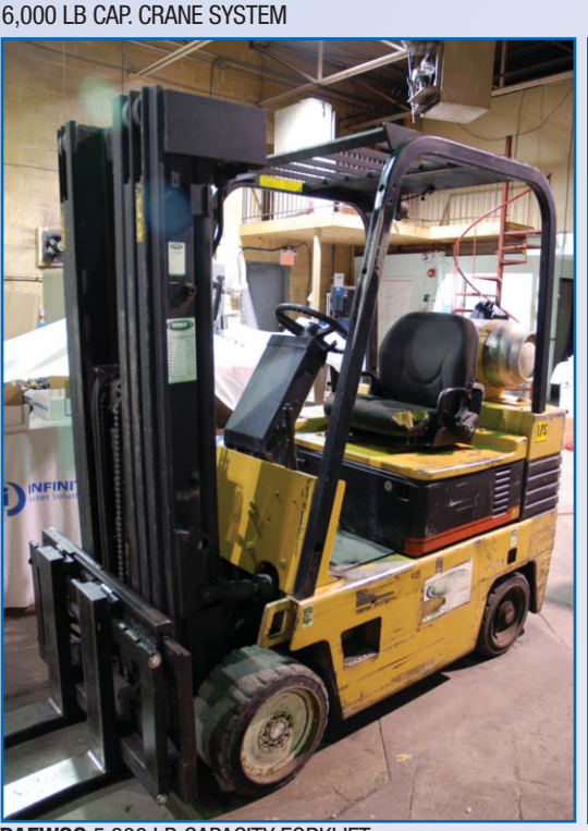
DAEWOO 5,300 LB CAPACITY FORKLIFT