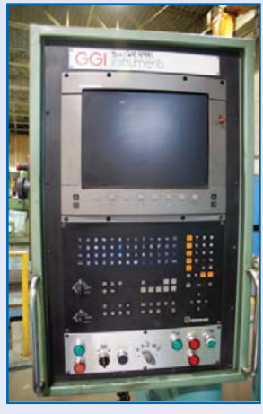
TOS Model WHN13.4C, 5" Spindle, 63" x 71" Table, Travels: X-78.7", Y-78.7", Z-26", Full 360,000 Position, 1,250 RPM, Heidenhain 426 CNC Control, 2 New Motors on X&Y, New Turcite On Gibbs, 50 HP Spindle Motor, sn 713384