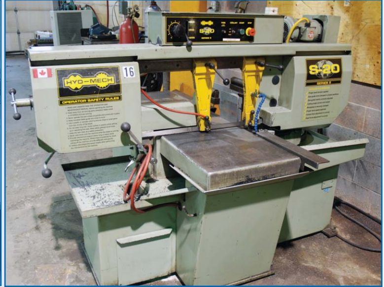
HYD MECH S-20 SERIES II HORIZONTAL BANDSAW