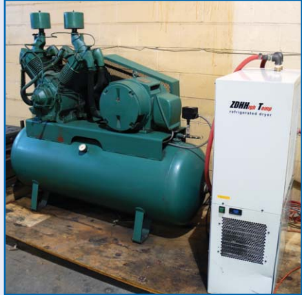
25 HP COMPRESSOR AND HI TEMP DRYER